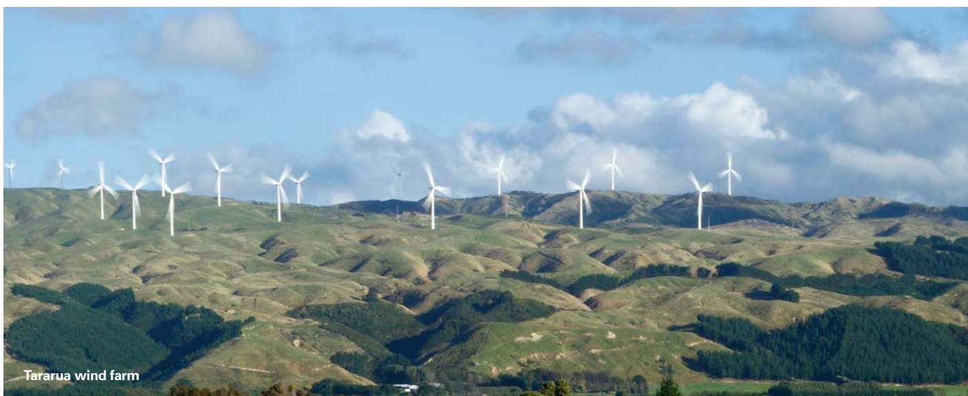
Tararua wind farm

NZ Wind Energy Association PO Box 553, Wellington 6140, New Zealand info@windenergy.org.nz October 2010